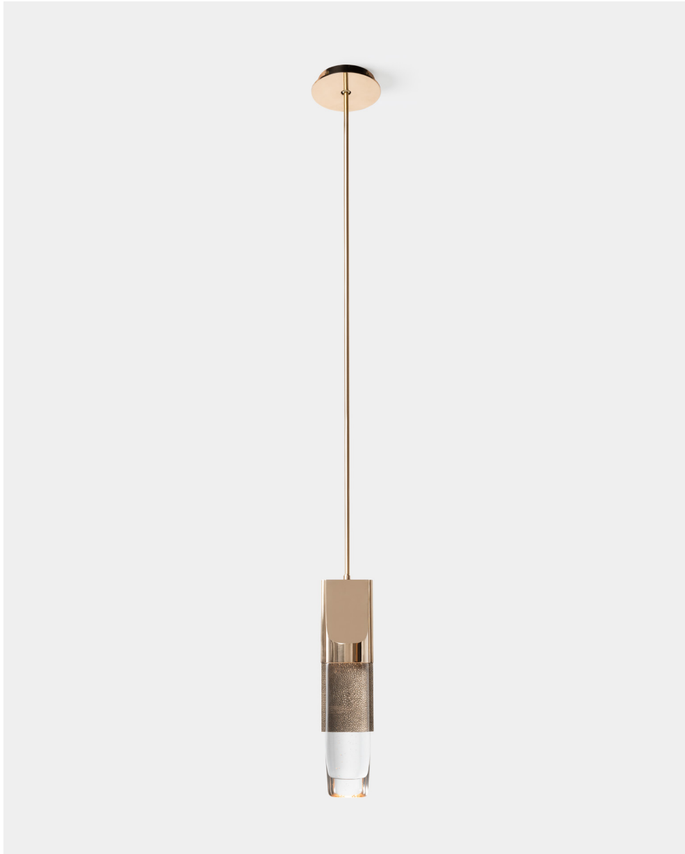
Shown in Polished Bronze and Clear Glass