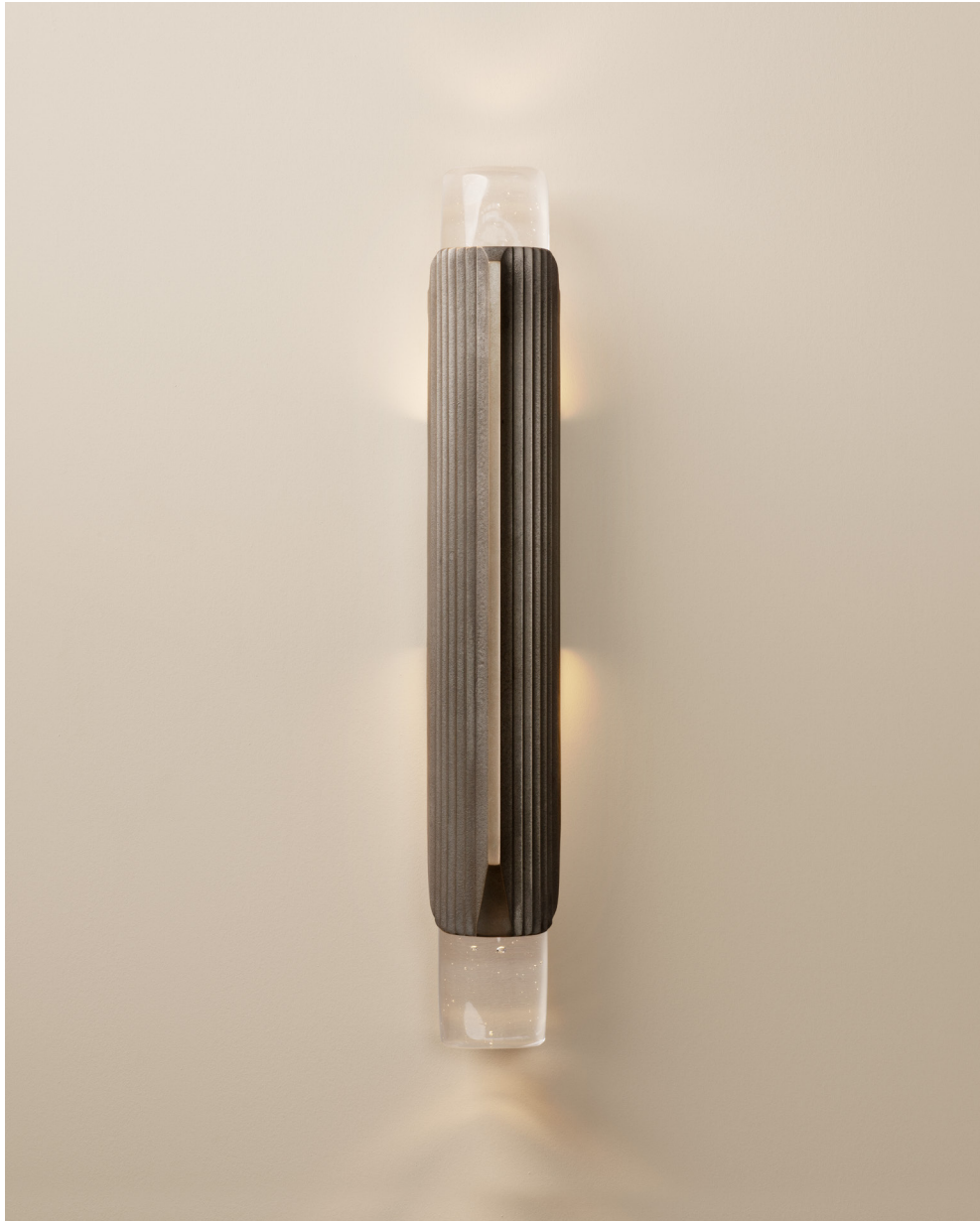
Shown in Silver Dollar Bronze and Clear Glass