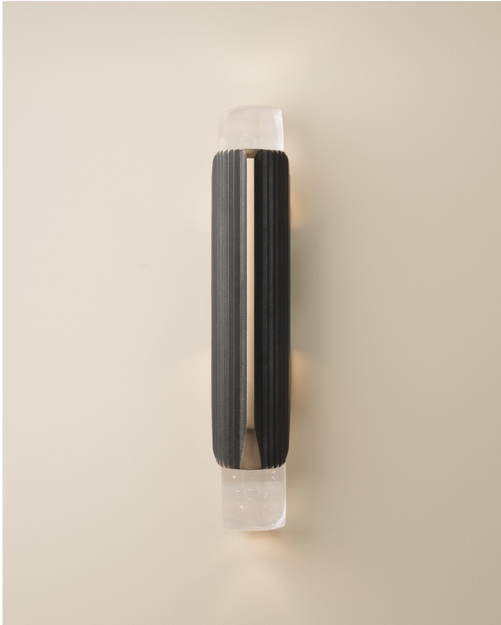
Shown in Jet Black Bronze and Clear Glass