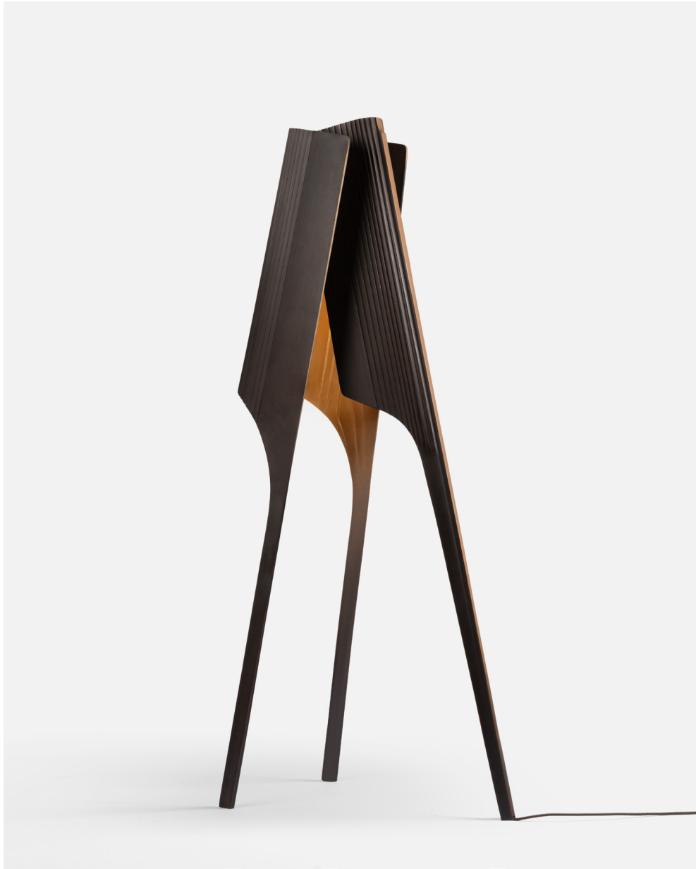
Shown in Otter Bronze